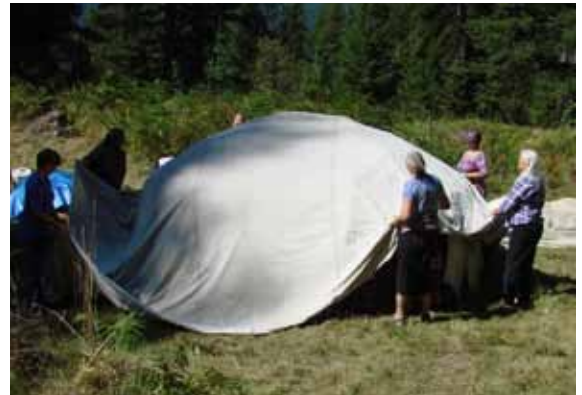
Photo to the right shows the final layer being adjusted.

Best to arrive Wednesday evening if you plan to help with set up. The sweat lodge requires 4 layers of blankets and tarps.