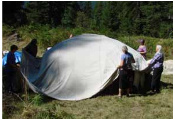
Photo to the right shows the final layer being adjusted.

Best to arrive Wednesday evening if you plan to help with set up. The sweat lodge requires 4 layers of blankets and tarps.